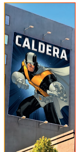
For Grand and Super-Wide Signage