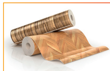
For Industrial Printing